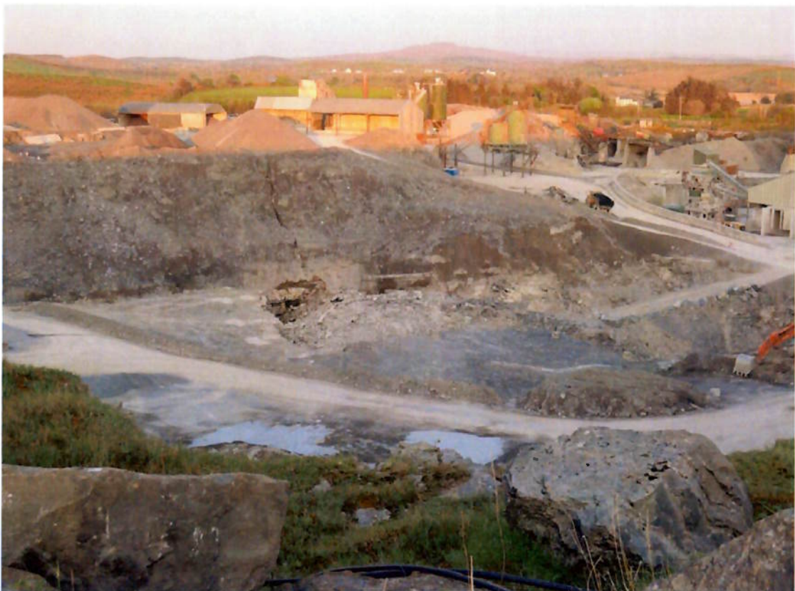
11 May 2016