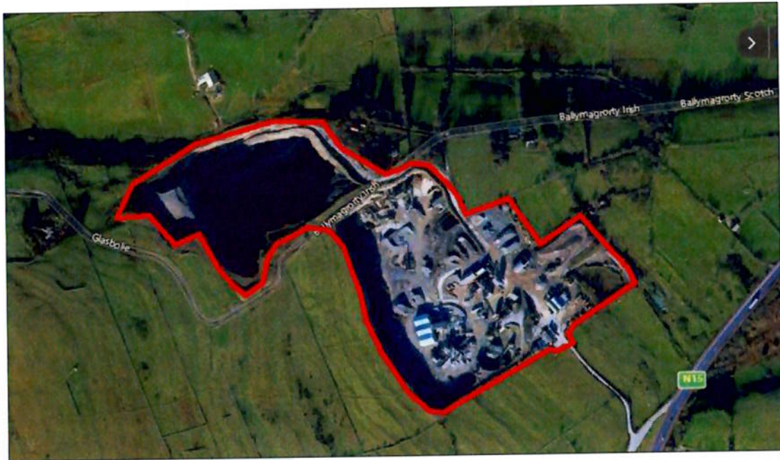
Figure 1: Quarry Extent

It is important to note that this planning application was made in respect of the entire quarry and the Inspectors report readily identifies this. For ease of reference, the extent of the quarry area is identified below in Figure 1.