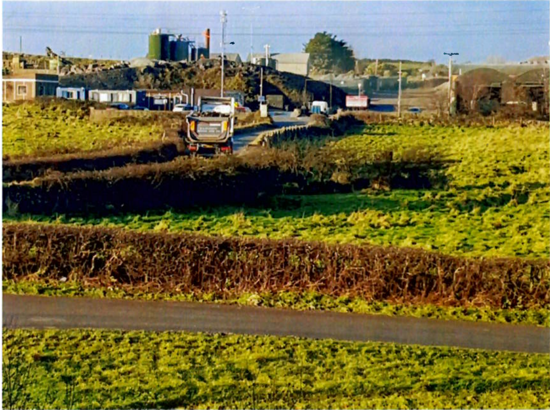
04 th January 2022 – Truck importing stone