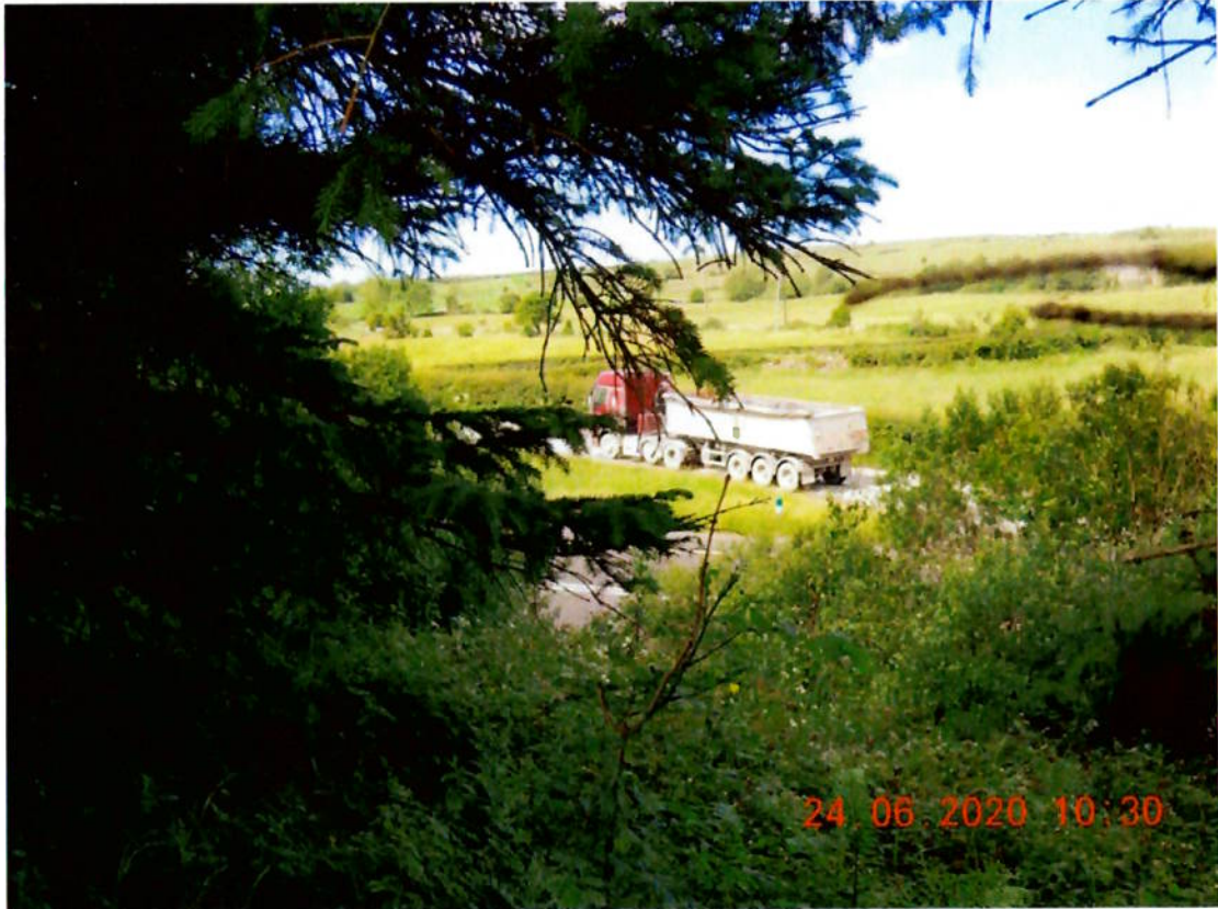
24 th June 2020 – Truck No. 2 importing stone