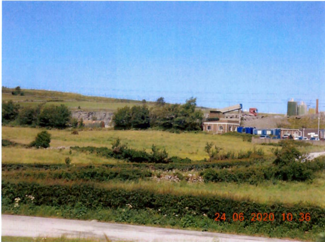
24 th June 2020 – Truck No. 2 importing stone