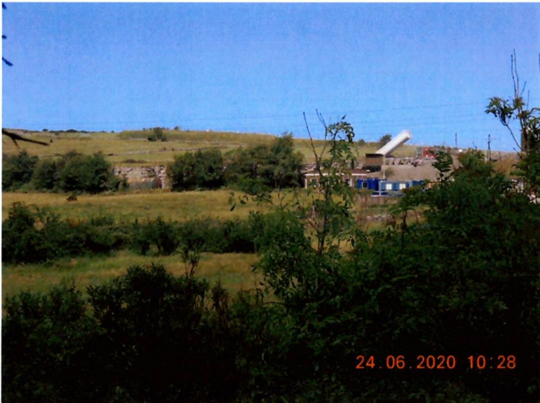
24 th June 2020 – Truck No. 1 tipping stone into quarry breaker - Trip cycle time 35minutes per load