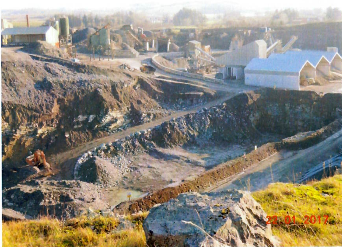
22 January 2017