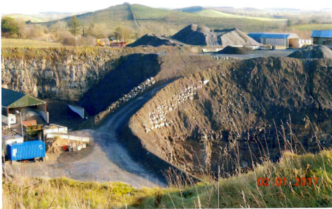
2 January 2017