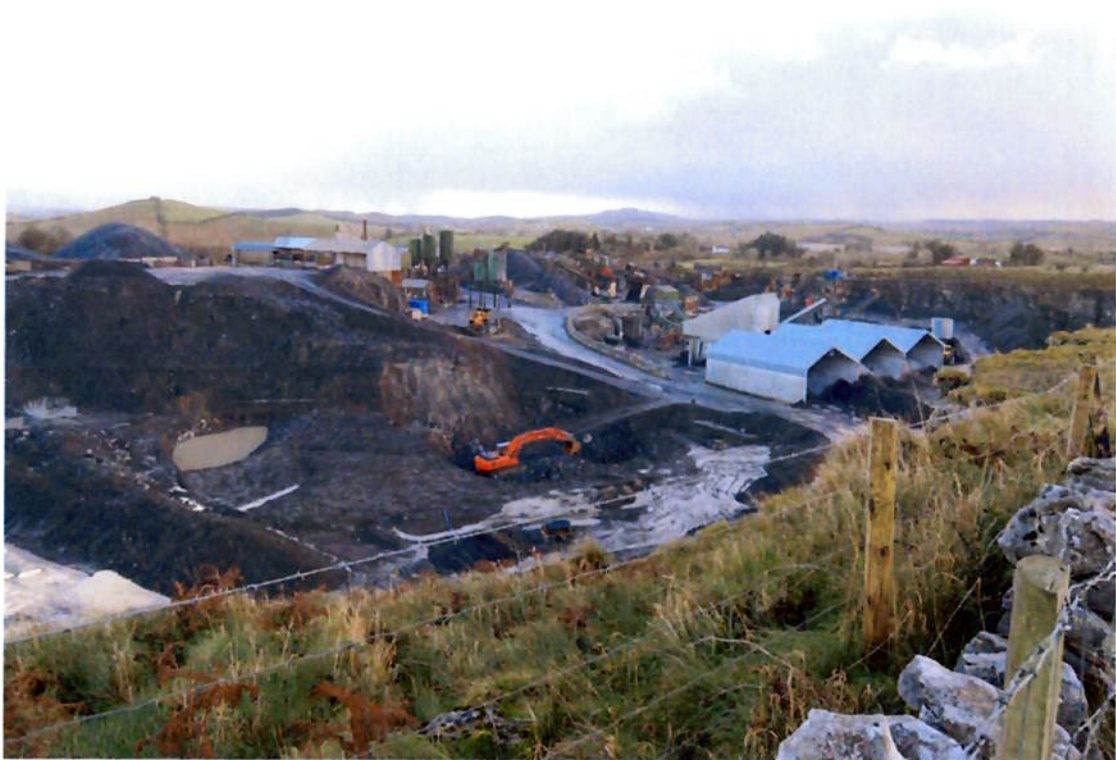
November 2015 – quarrying in south quarry