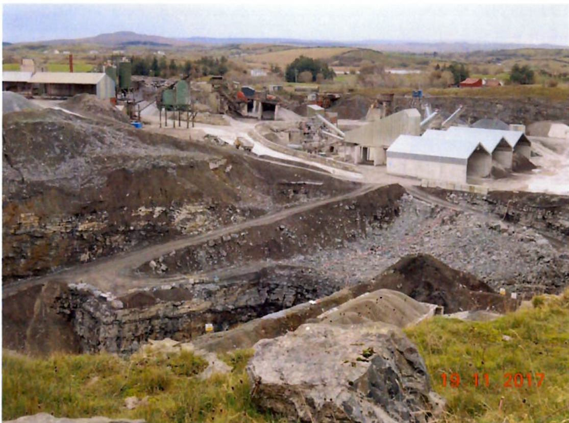
19 November 2017