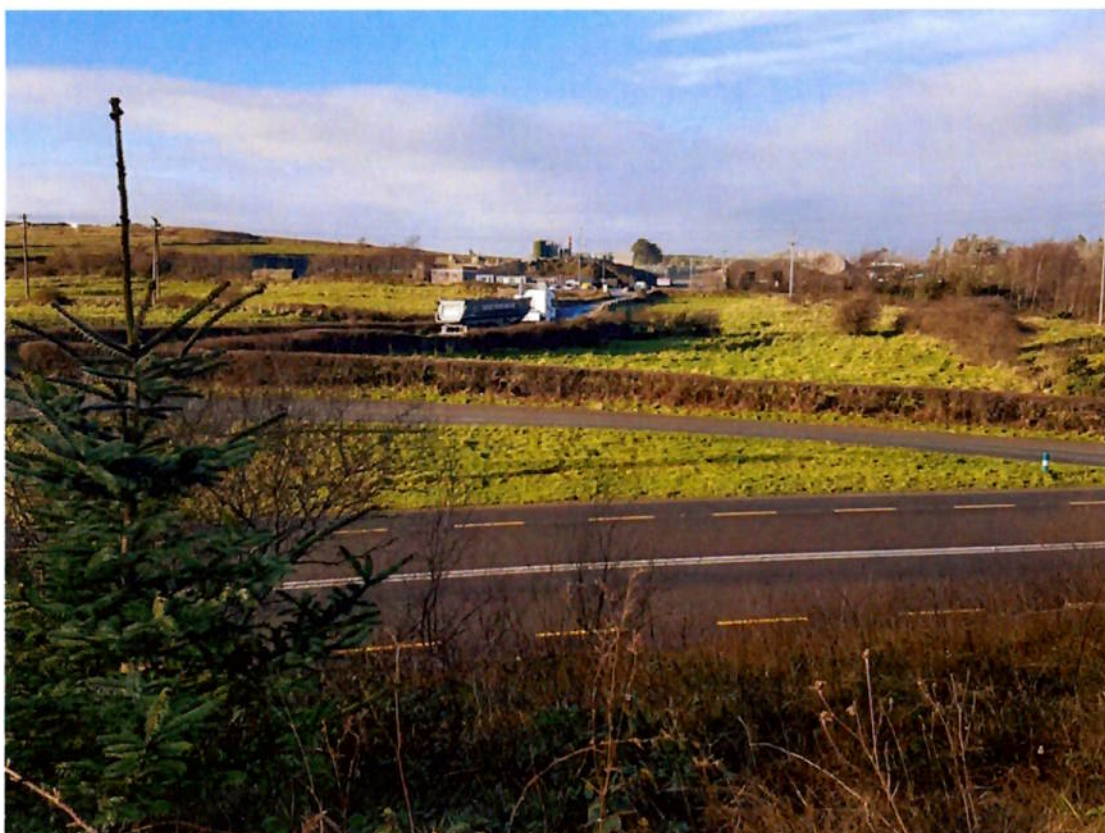
04 th January 2022 – Truck importing stone