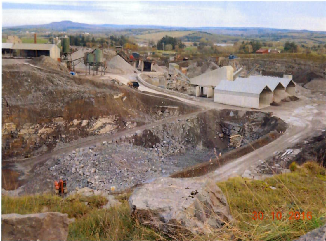
30 October 2016