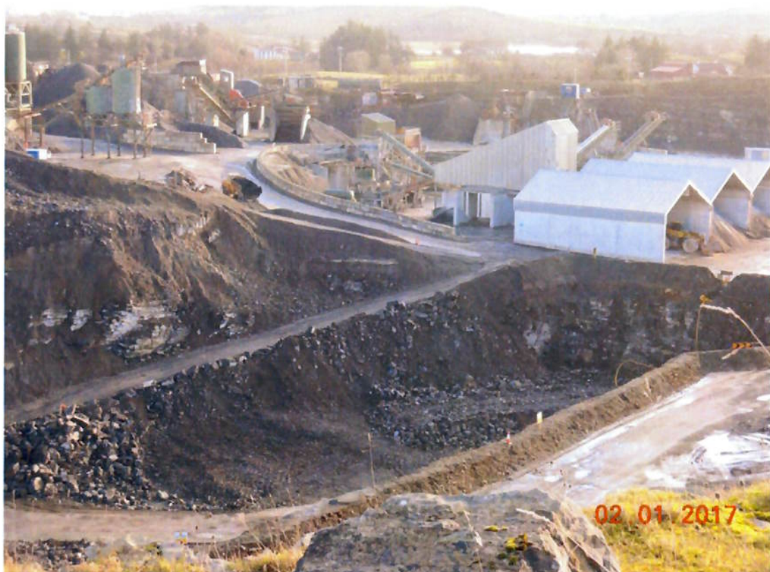
2 January 2017