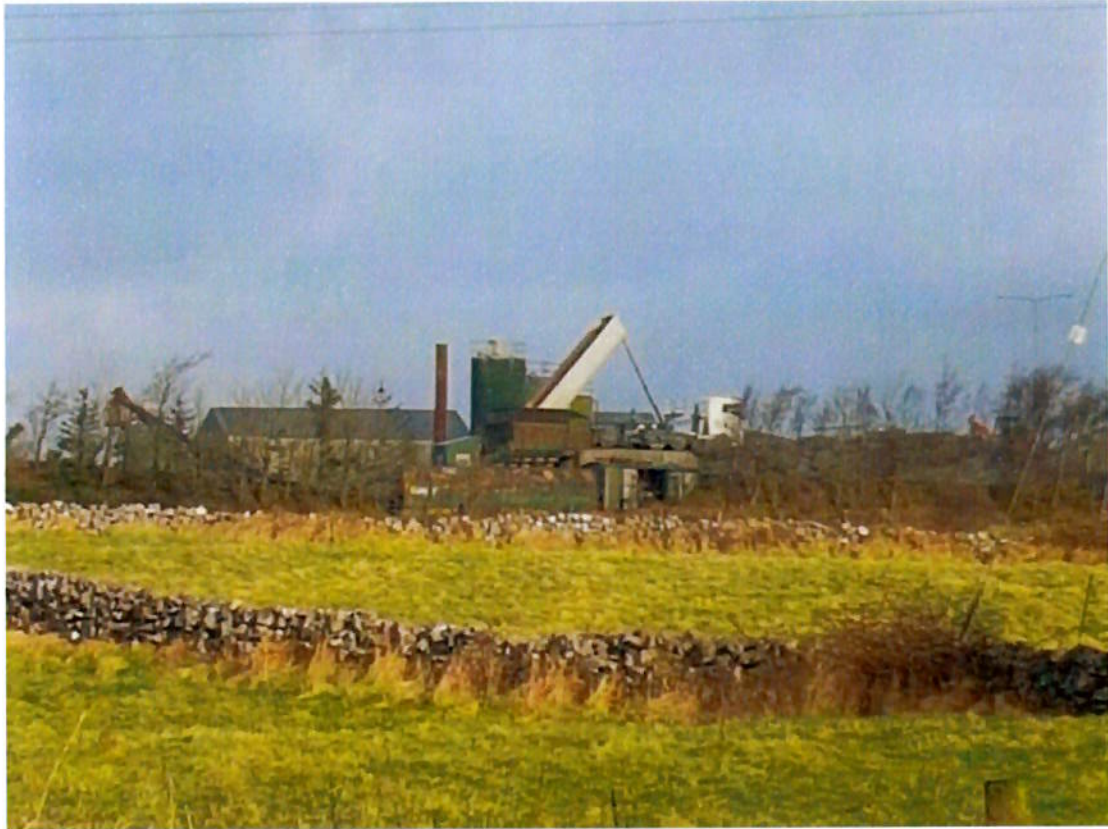
February 2021 – Truck tipping stone into quarry breaker