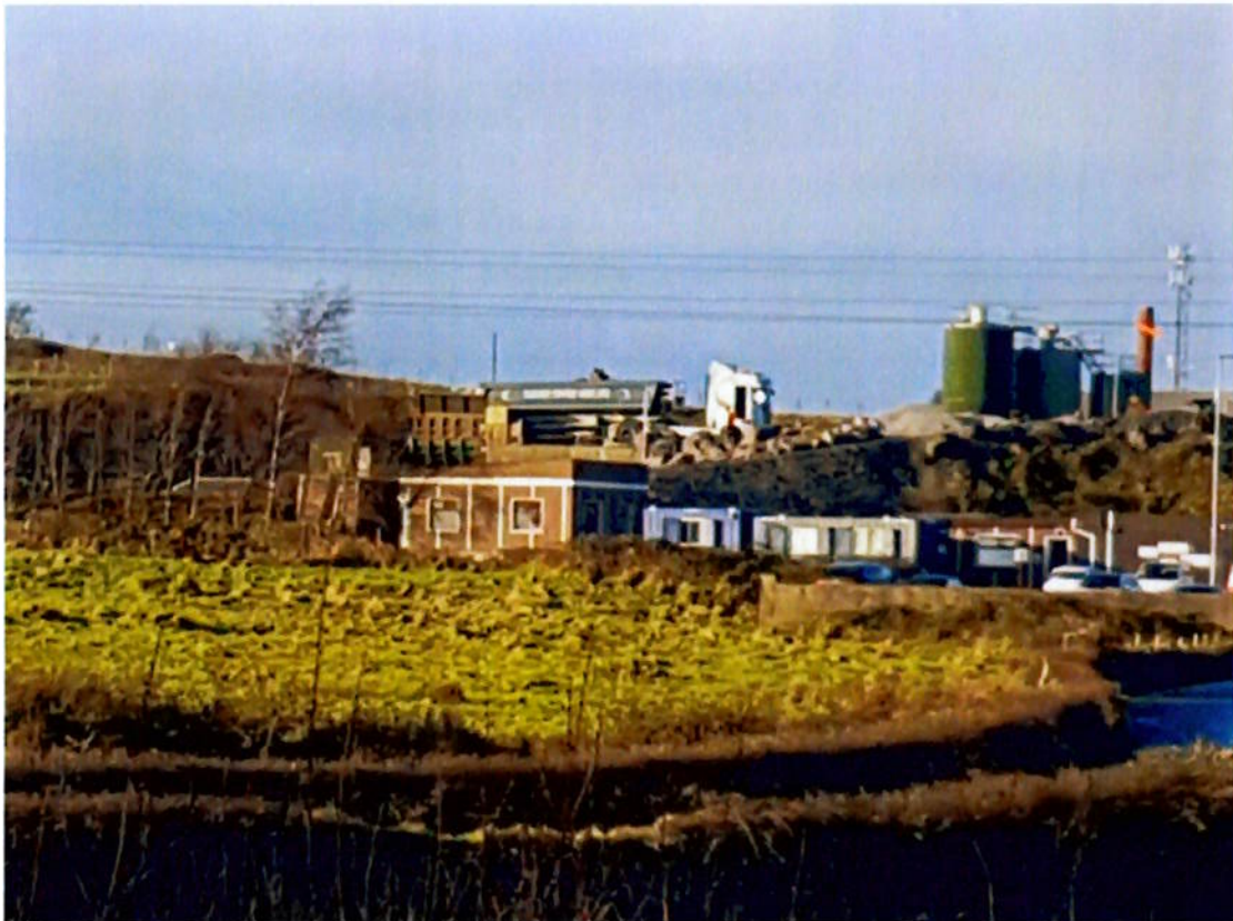
04 th January 2022 – Truck importing stone