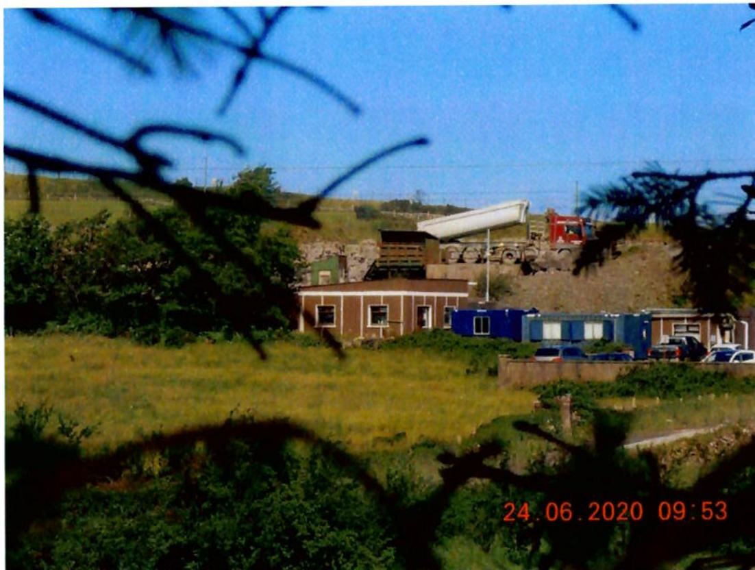
24 th June 2020 – Truck No. 1 importing stone to quarry