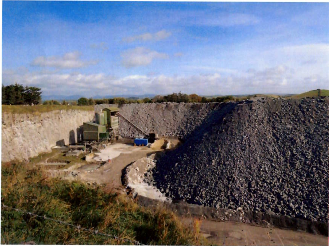
October 2013 – materials excavated in the north quarry stockpiled in the south quarry