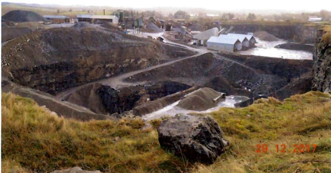
29 December 2017