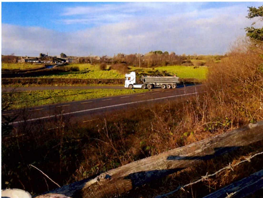
04 th January 2022 – Truck importing stone