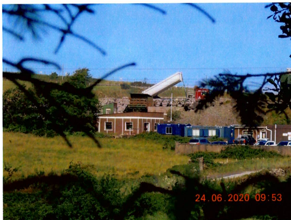
24 th June 2020 – Truck No. 1 tipping stone into quarry breaker