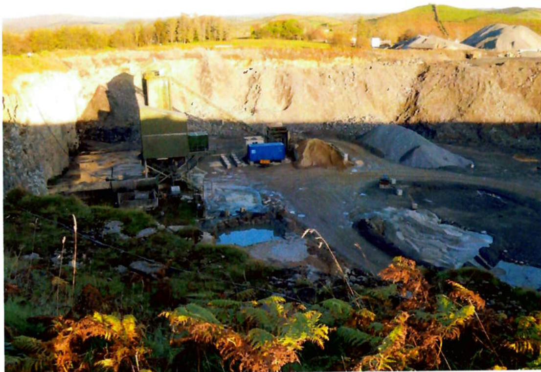
October 2015 – stockpiled materials exhausted and quarry operator commences quarrying on floor of south quarry