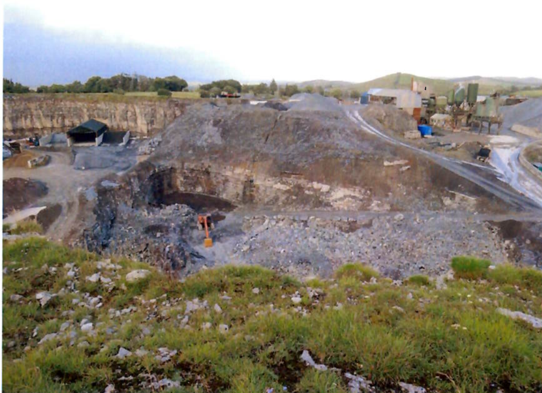
7 August 2016