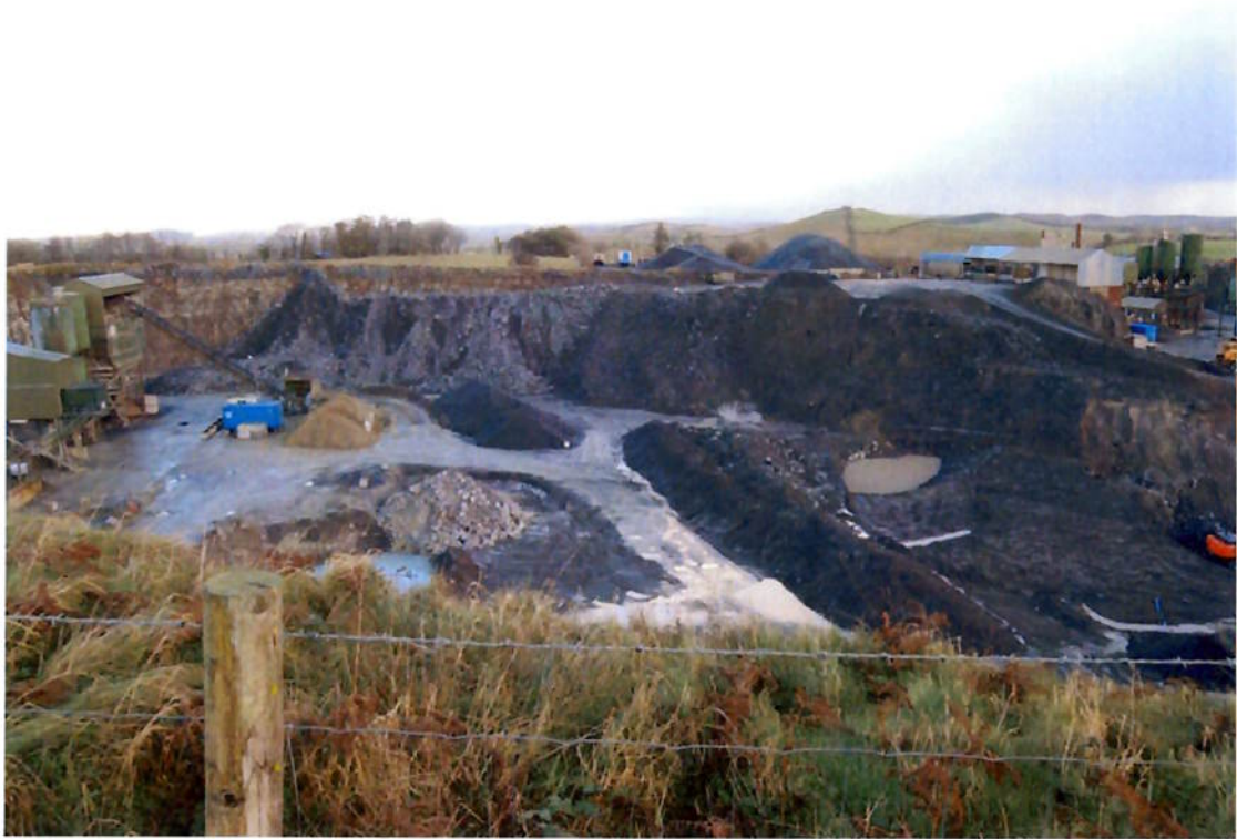
November 2015 – quarrying in south quarry