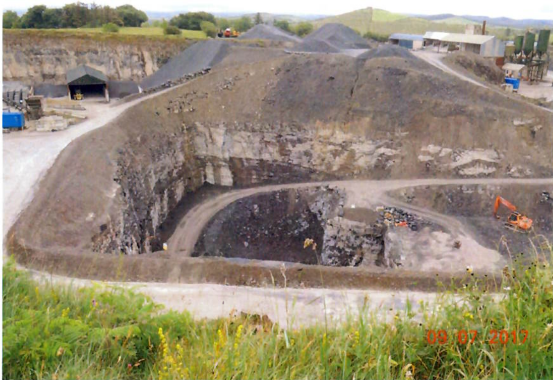
9 July 2017