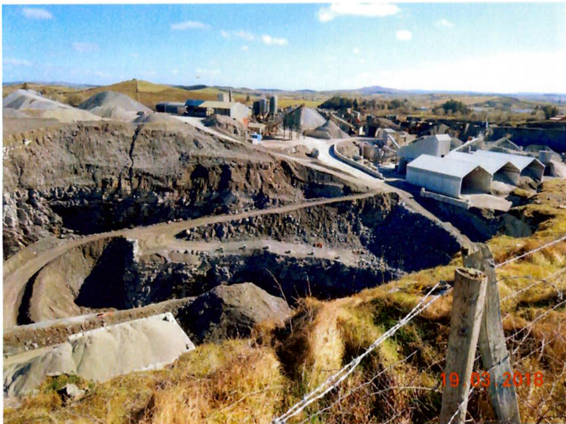
19 March 2018