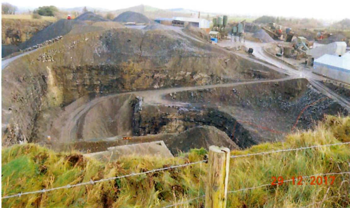
29 December 2017