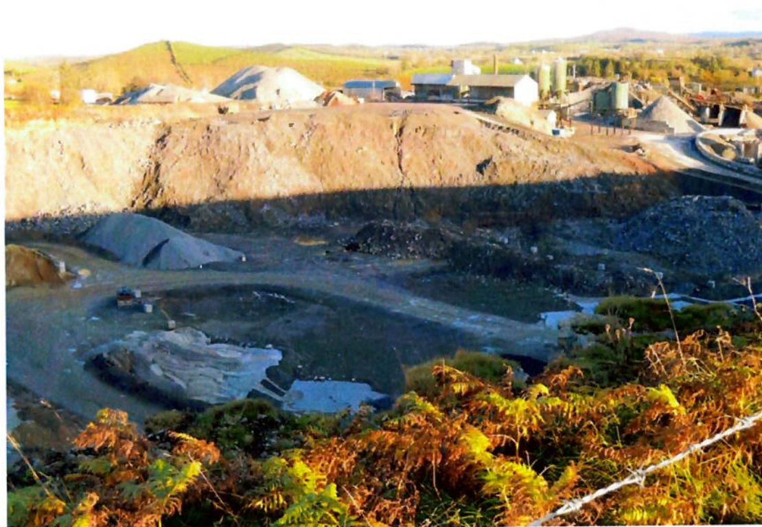
October 2015 – quarry operator commences quarrying in the floor of the south quarry