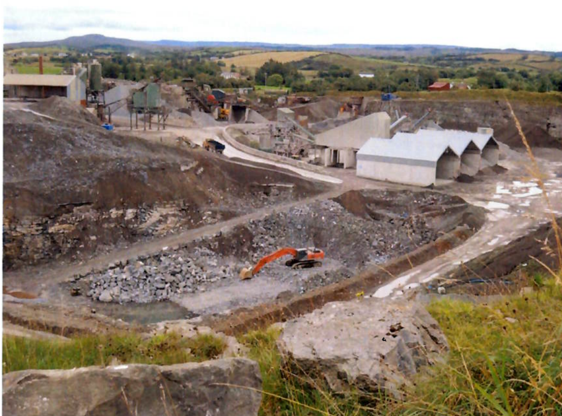
4 September 2016