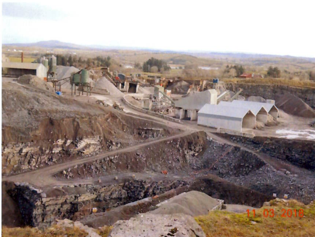
11 March 2018