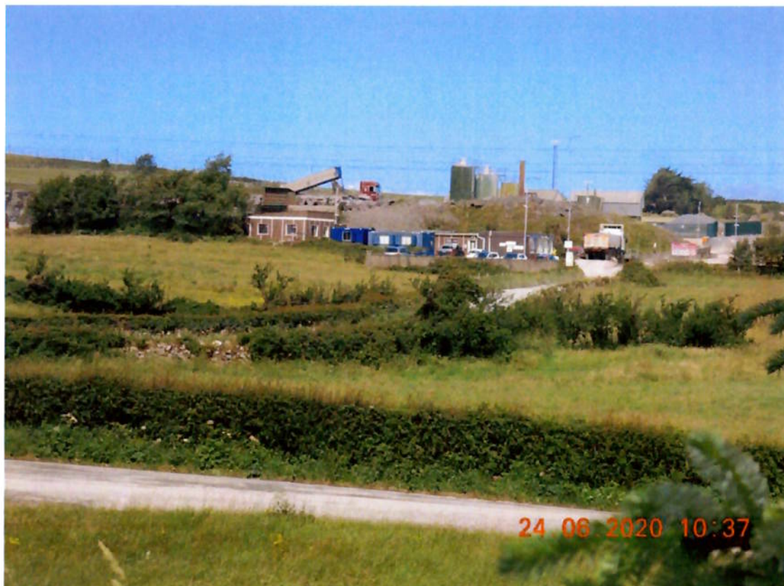
24 th June 2020 – Truck No. 2 tipping stone into quarry breaker