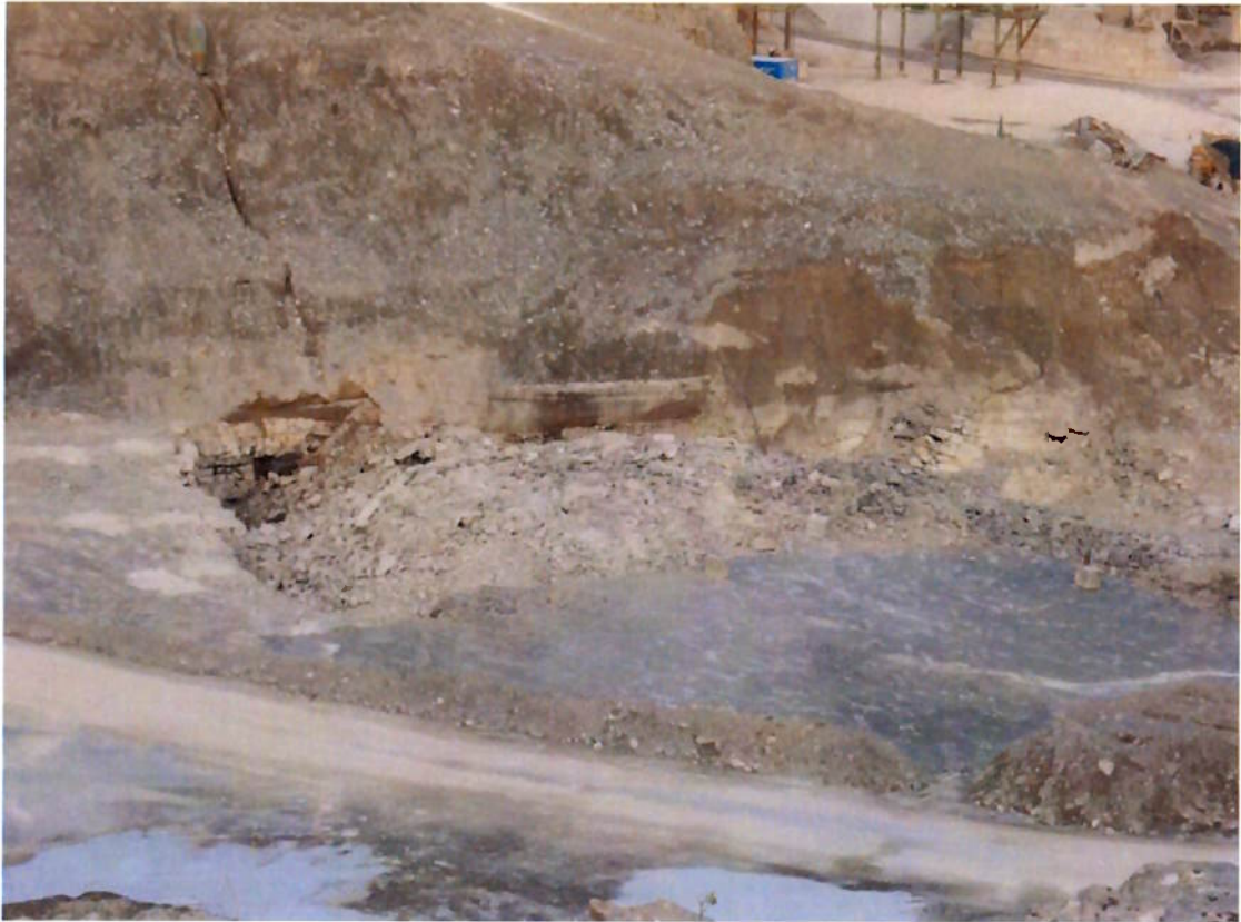
11 May 2016