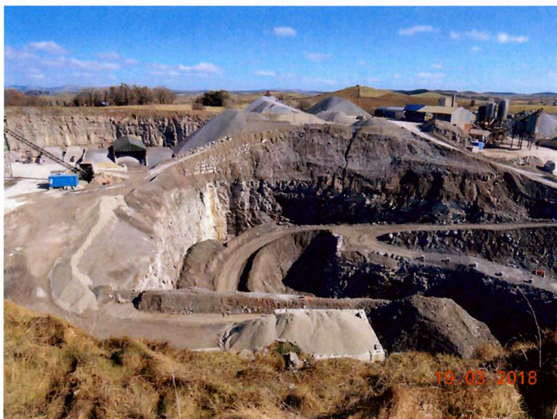
19 March 2018