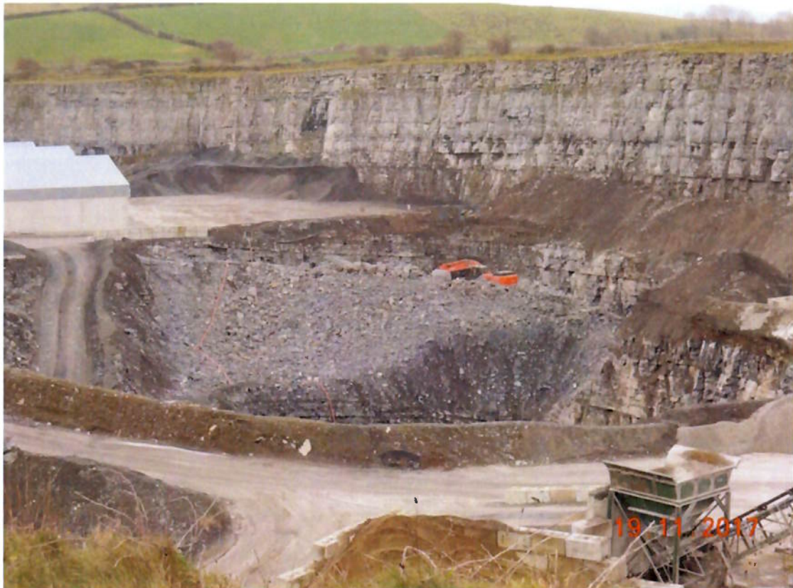
19 November 2017