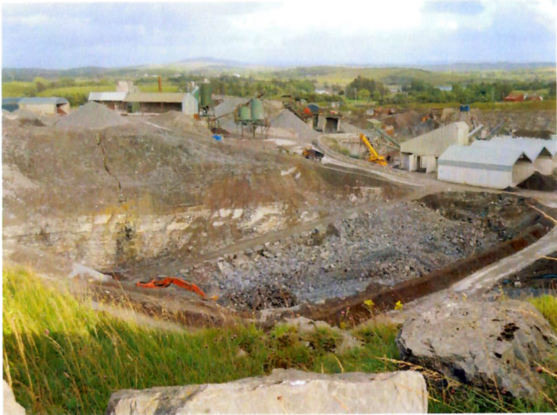
7 August 2016