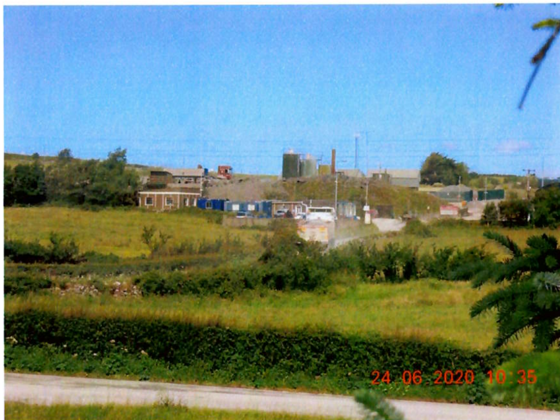
24 th June 2020 – Truck No. 2 importing stone