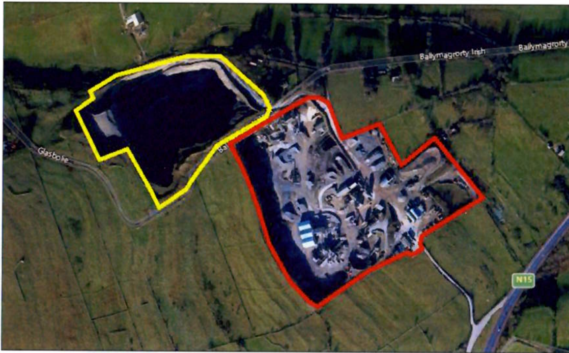
Figure 2: Quarry Areas

Notwithstanding these communications and the responses received, the Board considered that “the identified deficiencies have not been resolved and that consequently the application in respect of the quarry does not comply with the requirements of Section 261A(14) of the Planning and Development Act, 2000, as amended. The Board is precluded under sections 177K(1) and 261a(14) of the Planning and Development Act, 2000, as amended, from making a decision in these circumstances to grant or refuse substitute consent” and, accordingly the Board decided to dismiss the application pursuant to Section 133 of the Planning and Development Act, 2000.