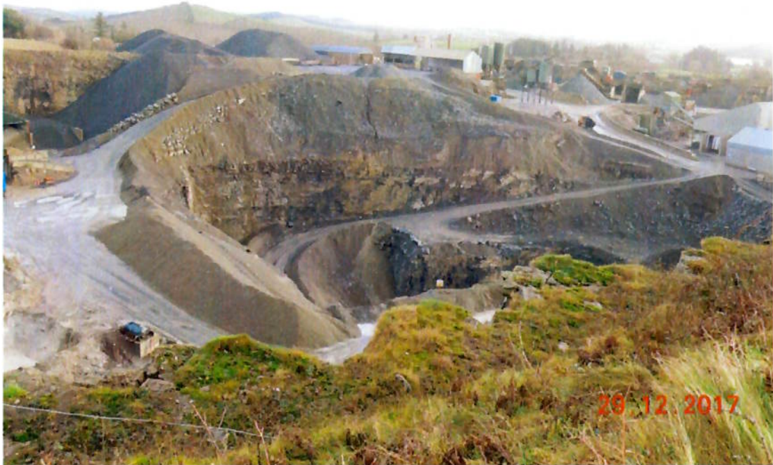
29 December 2017