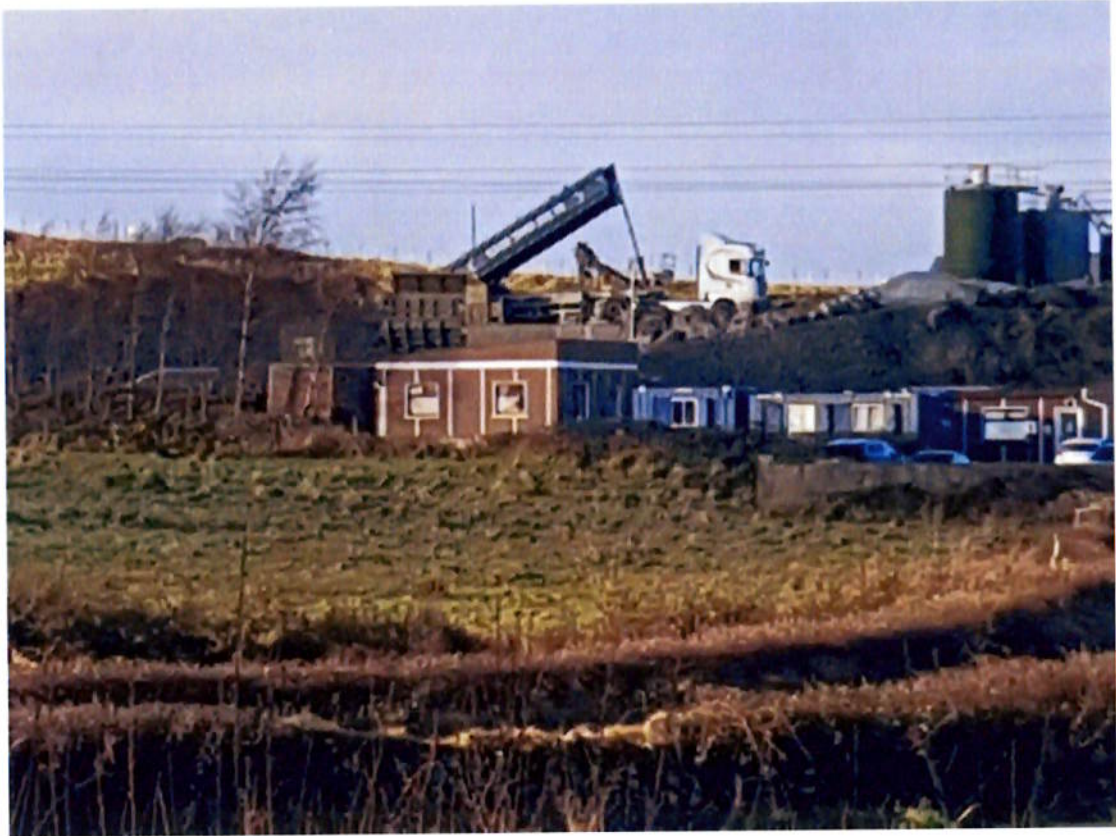
04 th January 2022 – Truck tipping stone into quarry breaker