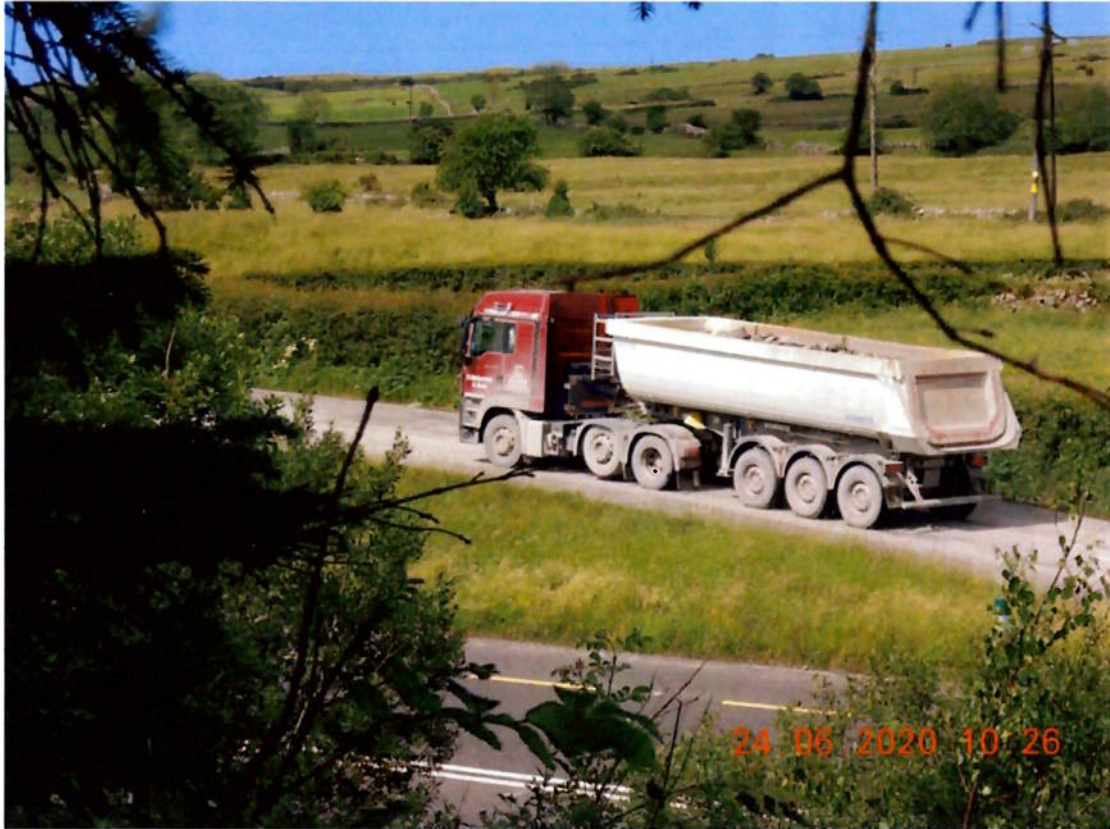
24 th June 2020 – Truck No. 1 returning with another load of stone