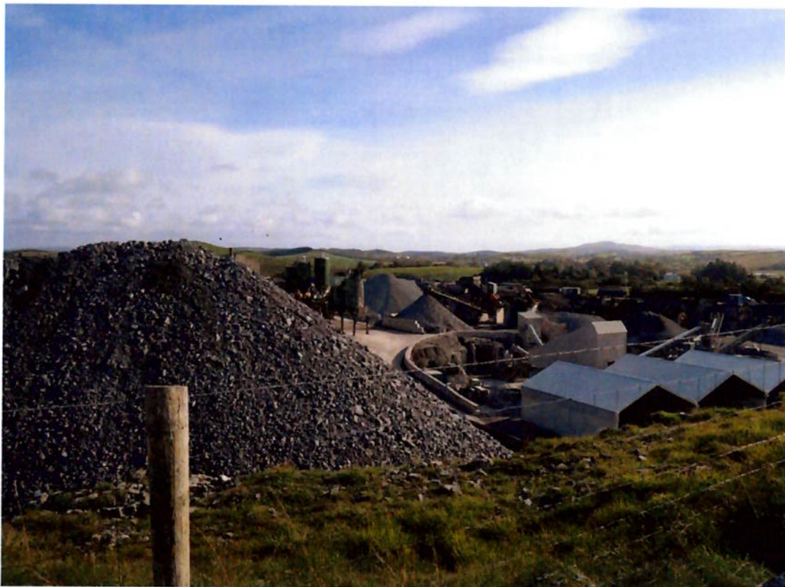
October 2013 - materials excavated in the north quarry stockpiled in the south quarry