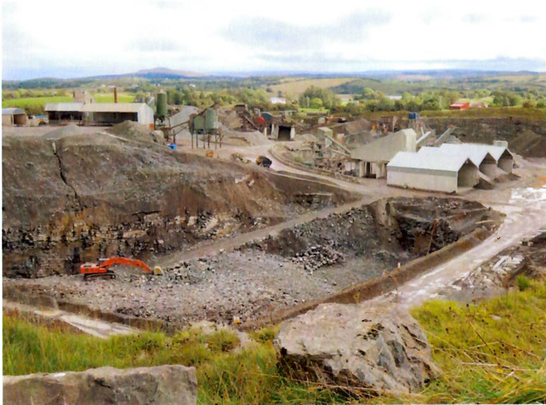
18 September 2016