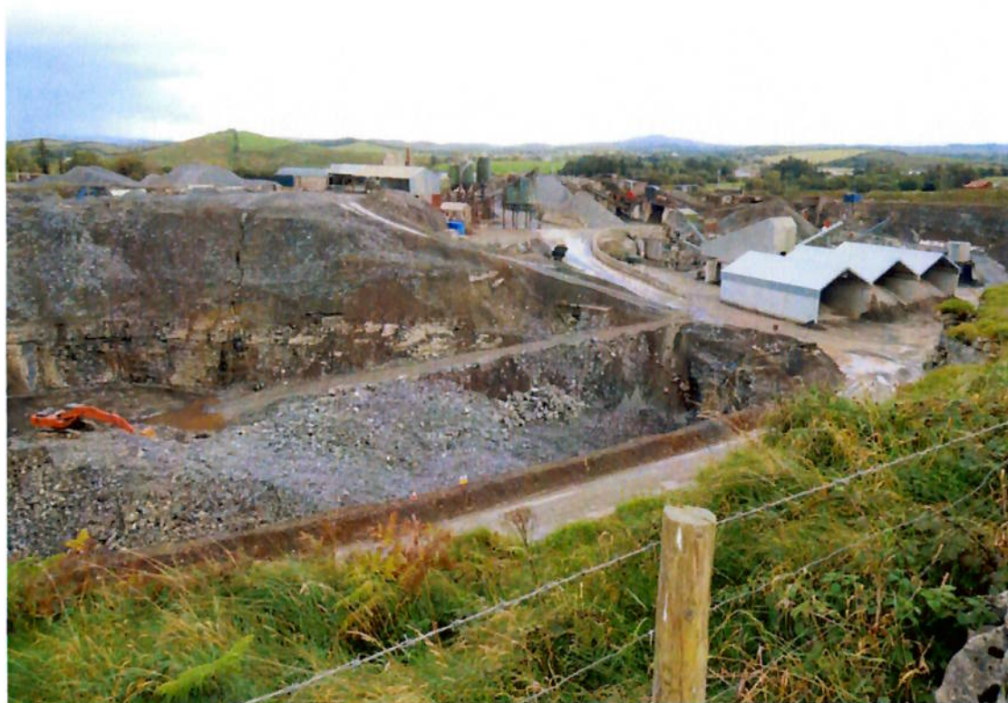
25 September 2016