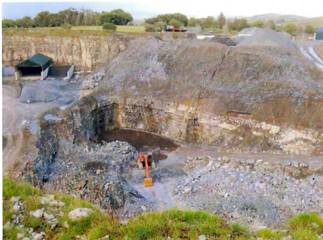
7 August 2016