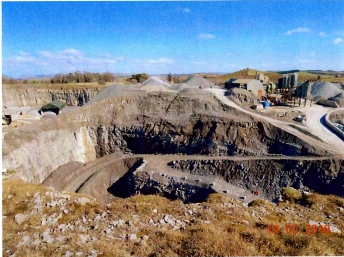
19 March 2018