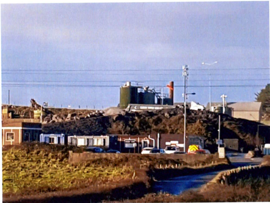
04 th January 2022 – Truck on route for another load